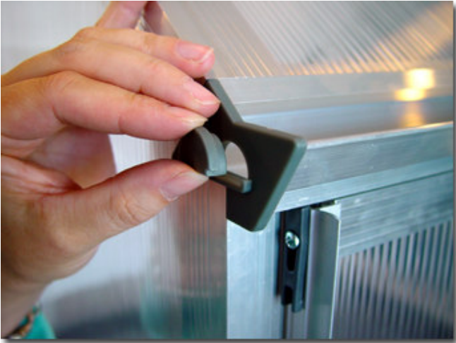
You will need to block the gutter at either end using part 86 if you