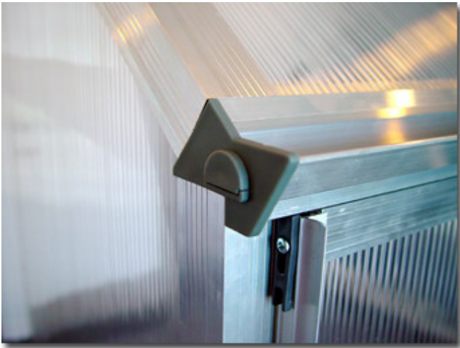
The plug is a part of fitting no. 86.